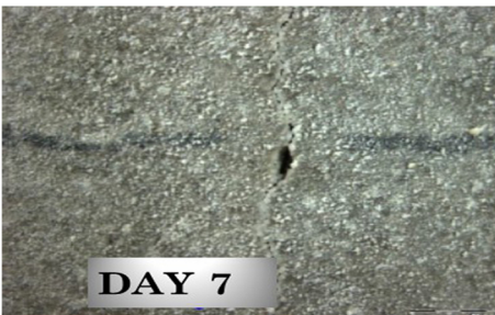
Day 7 (Crystallization starts)