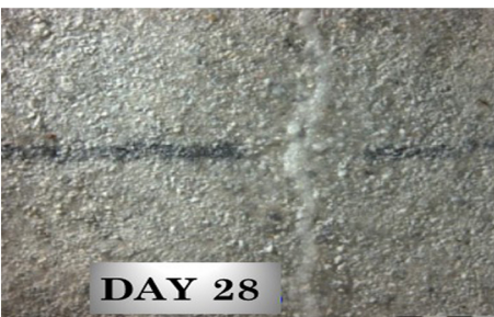
Day 28 (Crystallization Matures)